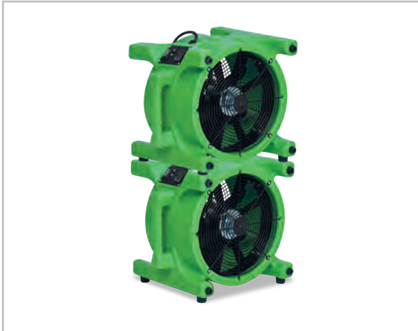
Fig. 1: Stacking with max. 2 units

The units can be stacked to save space if required.